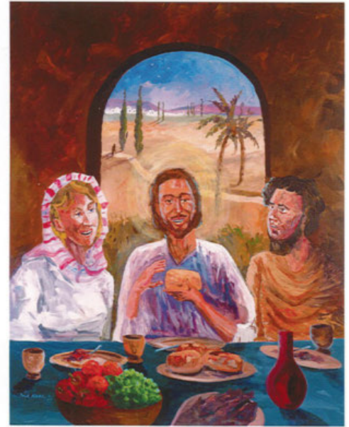
Evening In Emmaus

During this Easter Season I have been reading a couple of books that I recommend. First is Come Forth: The Promise of Jesus' Greatest Miracle by Jame Martin, SJ. Fr. Martin helps us deeply consider the raising of Lazarus by Jesus (John 11:1-46). He describes for us the site thought to have been the place where Lazarus was entombed. He gives us a feel for what pilgrims experience when they enter the chamber where Lazarus' body was placed, and from which Jesus called him forth. He takes us carefully through the story in St. John's Gospel, helping us consider the events from the points of view of the different people involved: Lazarus' sisters Martha and Mary, Jesus himself, Lazarus, the disciples, and the other people who witnessed Lazarus emerge from the tomb. At each part of the story, Fr. Martin invites us to reflect on what this Scripture might be saying to us. How might Jesus be calling us to come forth from our emotional and spiritual "tombs?"