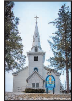
Immaculate Conception Church 1660 Front Street Route 9 Keeseville, New York

Catholics Along the Au Sable River consisting of the following parishes Catholic Community of Holy Name & St. Matthew Roman Catholic Community of Keeseville St. Margaret's Parish