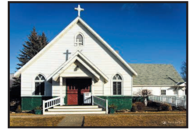
St. Margaret's Church 5789 NY State Route 86 Wilmington, New York