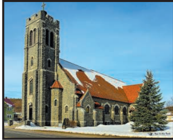
Holy Name of Jesus Church 14203 State Route 9N Au Sable Forks, New York