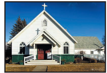
St. Margaret's Church 5789 NY State Route 86 Wilmington, New York