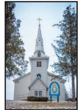
Immaculate Conception Church 1660 Front Street Route 9 Keeseville, New York

Catholics Along the Au Sable River consisting of the following parishes Catholic Community of Holy Name & St. Matthew Roman Catholic Community of Keeseville St. Margaret's Parish