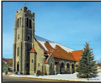
Holy Name of Jesus Church 14203 State Route 9N Au Sable Forks, New York