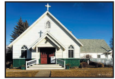
St. Margaret's Church 5789 NY State Route 86 Wilmington, New York