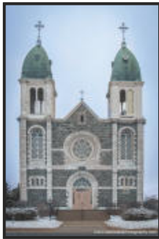
St. John the Baptist Church 1803 Main Street NY State Route #22 Keeseville, New York