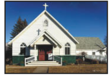
St. Margaret's Church 5789 NY State Route 86 Wilmington, New York