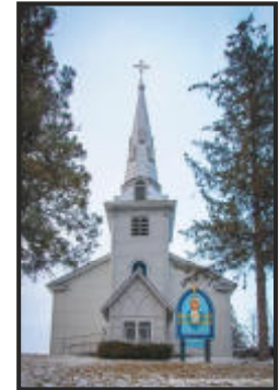
Immaculate Conception Church 1660 Front Street Route 9 Keeseville, New York

MAILING ADDRESSES: P.O. Box 719, Au Sable Forks, NY 12912 1804 Main Street, Keeseville, NY 12944