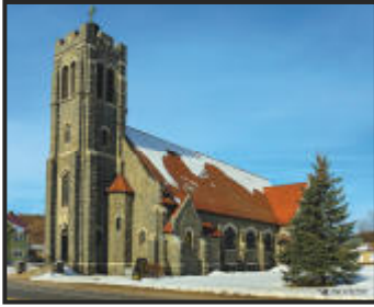
Holy Name of Jesus Church 14203 State Route 9N Au Sable Forks, New York