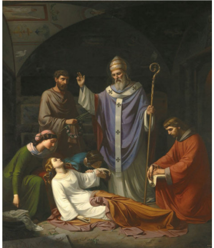
Burial of St. Cecilia-Luis de Madrazo