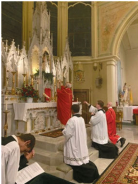
Pentecost Vigil Mass

8am Mass ~ Our Lady of Peace Church 10am Mass ~ St. Cecilia Church