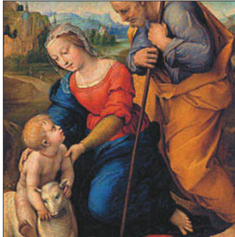
"The Holy Family with a Lamb" (Raphael, 1507)

Response: Lord, hear your people's prayer. • For the Church. Give us the faith and