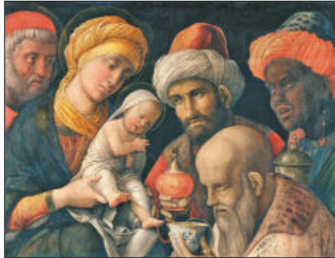
"Adoration of the Magi" (Andrea Mantegna, 1500)

May we heal those who have been hurt, angry and abused. Welcome those who have felt inferior or afraid. Understand and alleviate the spiritual hungers of our young people.