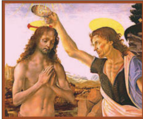
"The Baptism of Christ" (Andrea Verrocchio and Leonardo da Vinci, 1475)

Your love, O God, fills our Christmas season. Even in these times that seem so dark, days and nights filled with fear and confusion, your Gospel Light shines through. Like heavens torn open before us, your spirit of love descends, your voice rebounds throughout the world with echoes sweeping from past to future generations showing your delight in us. You have chosen us to live in this time, to bring witness to our faith. Now, when many are lonely and afraid, we proclaim boldly that we are safely yours, that all is yours. Strengthen us; make us mighty so that we may confront these times with faith and vision. Pour your waters of grace and blessing upon us. Shower us in tender safety and comforting peace. Amen.