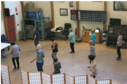
↑ These folks will leave in a great mood! ↑

The Gloucester Council on Aging is offering this class FREE to you. It will take place at 9:30 A.M. on Mondays. Bring your own yoga mat.