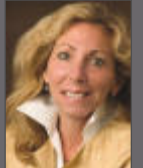
Senior Real Estate Specialist Since 2004