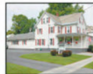
South Glens Falls 518-745-8116