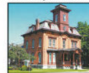
Fort Edward 518-747-9266