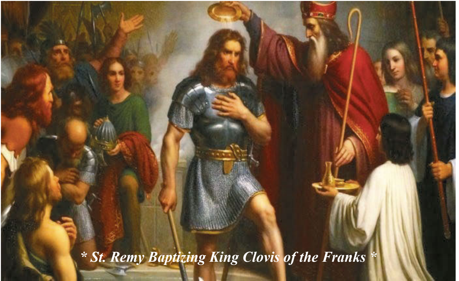
* St. Remy Baptizing King Clovis of the Franks *