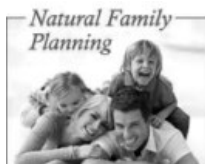
Natural Family Planning

ASSISTANCE IS AVAILABLE BY DIALLING 2-1-1. Calling this confidential line enables you to talk to a live crisis trained representative 24 hours a day, 365 days a year. This line has information about the many human services available in Shelby County, including mental health counseling services, substance abuse, food pantries, hot meals, senior programming, and rent and utility assistance.