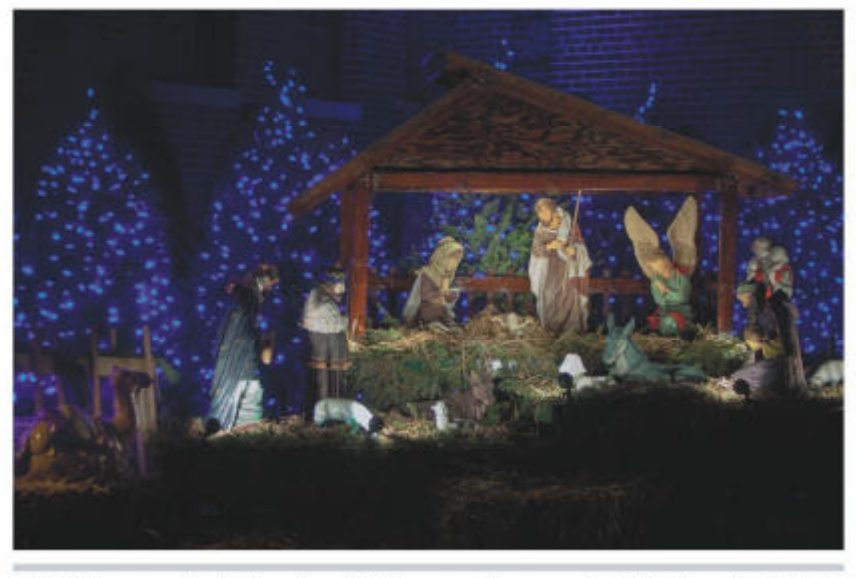
A Nativity scene is displayed on Christmas on the grounds of St. Francis of Assisi Church in Haskell, N.J.

But why was December 25 chosen? Many believe that the date was chosen to counter the Roman feast of Saturnalia. Certain ly, in the history of the Church, and the history of Christmas in particular, there are plenty of examples of Christians shifting local pagan observances to Christian ones, effectively "baptizing" their culture and customs. This doesn't mean that Christmas is