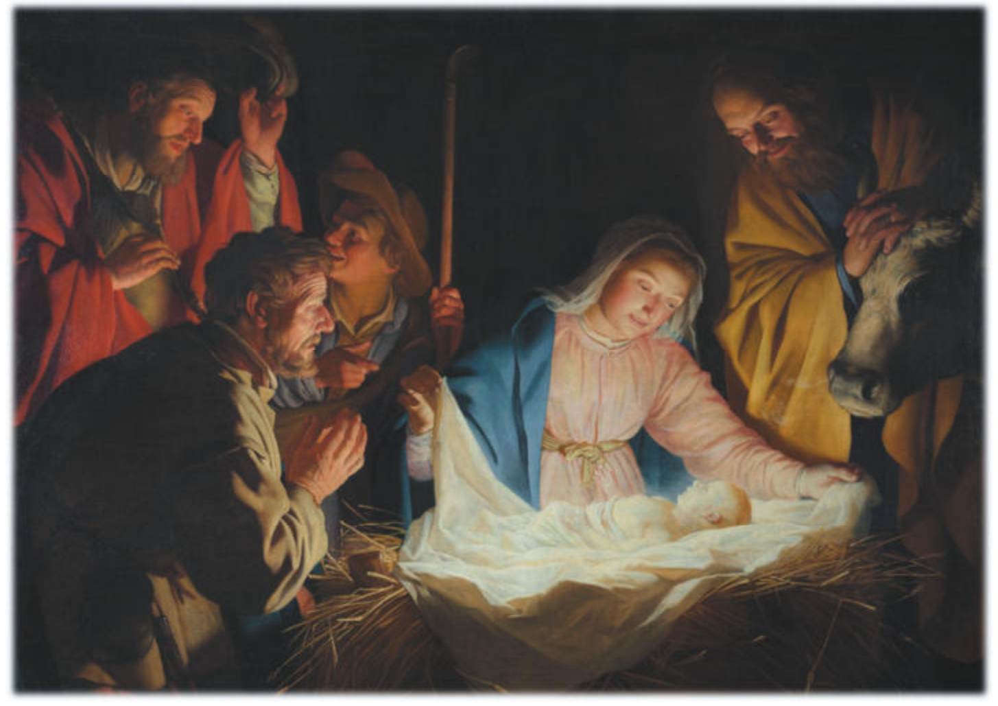
"For a child is born to us, a son is given us; upon his shoulder dominion rests." —Isaiah 9:5