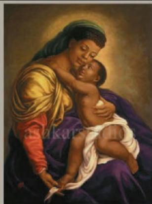
“Madonna and Child”