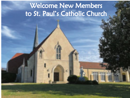
Welcome New Members to St. Paul's Catholic Church