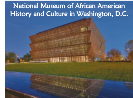
National Museum of African American History and Culture in Washington, D.C.

All are welcome and encouraged to attend. Nothing like a friendly face and warm greeting to make folks feel welcomed and included!