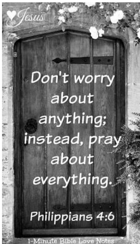
Another 1-minute devotion from BibleLoveNotes.com

THE LAST MASS TO HAVE LIVE STREAMING WILL BE ON AUGUST 29, 2021