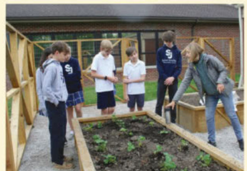
Giving thanks and asking God to watch over our garden.