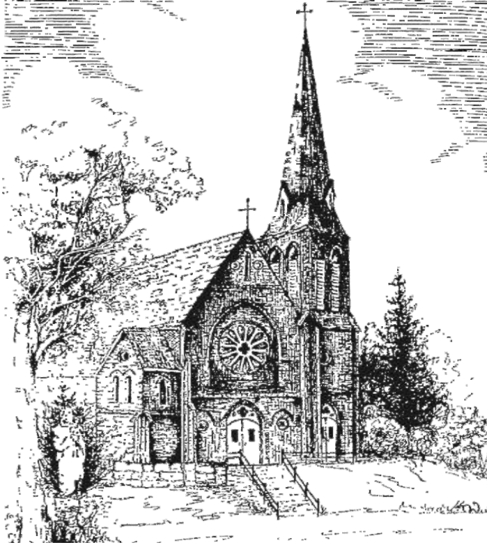
ST. JOSEPH 145 E. Main Street Fredonia, NY 14063 716-679-4116