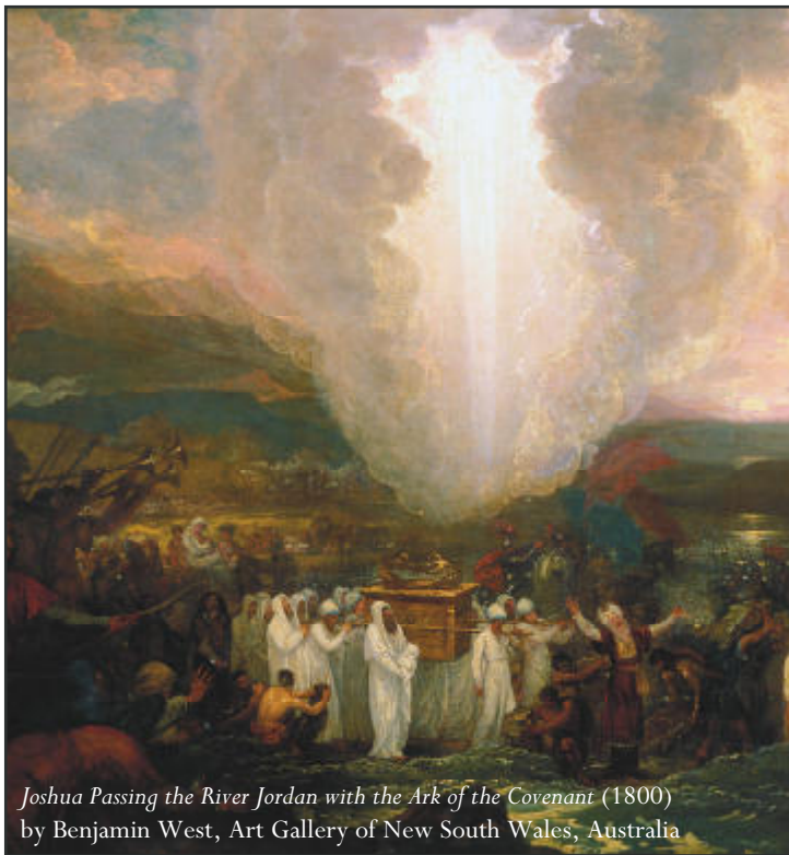
Joshua Passing the River Jordan with the Ark of the Covenant (1800) by Benjamin West, Art Gallery of New South Wales, Australia