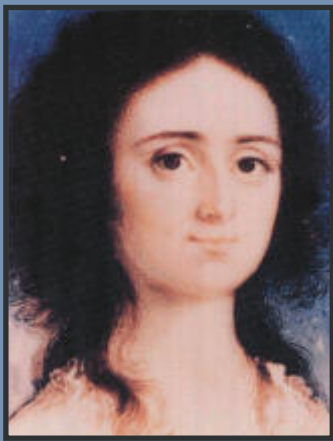
Elizabeth Ann Bayley in 1794, at the time of her wedding to William Seton, Jr.

Faith lifts the staggering soul on one side. Hope supports it on the other. Experience says it must be, and love says let it be.