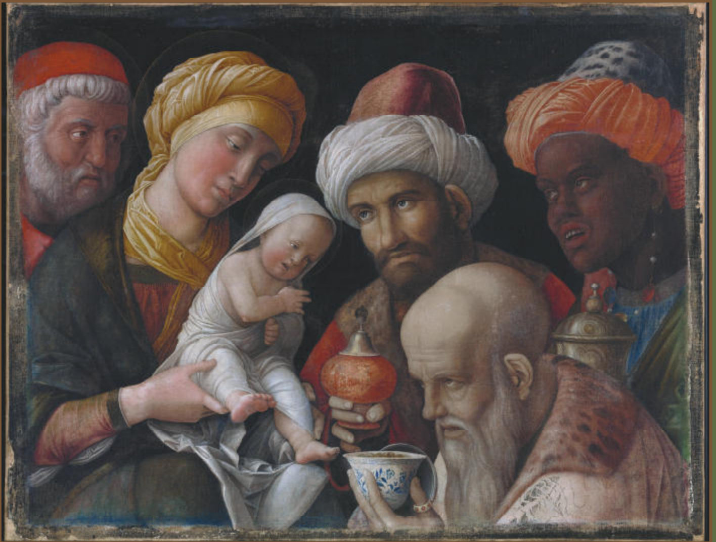
Adoration of the Magi (1500) by Andrea Mantegna, J. Paul Getty Museum, Los Angeles

January 2, 2022 ~ The Epiphany of the Lord