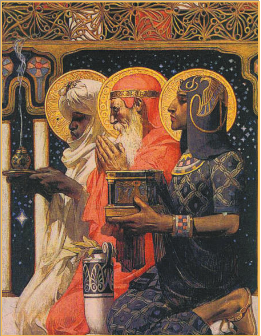
The Wise Men (1900) by J.C. Leyendecker

“...In worshiping, we too will discover, like the Magi, the meaning of our journey. And like the Magi, we too will experience “a great joy.” (Matt 2:10)