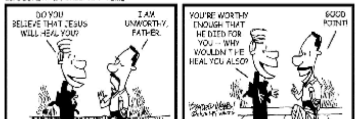
23rd SUNDAY IN ORDINARY TIME