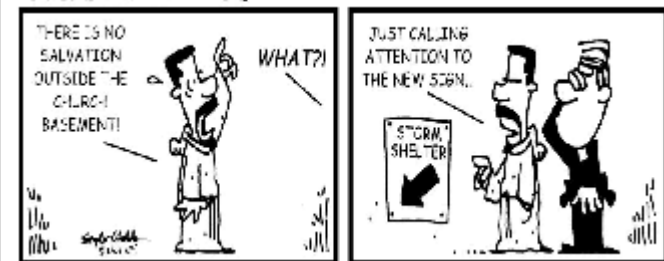
26TH SUNDAY IN ORDINARY TIME