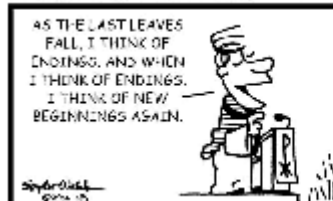
33RD SUNDAY IN ORDINARY TIME