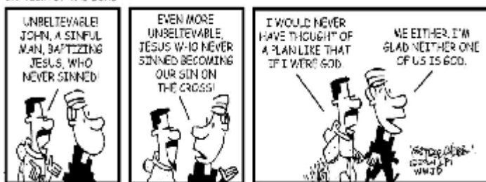
BAPTISM OF THE LORD