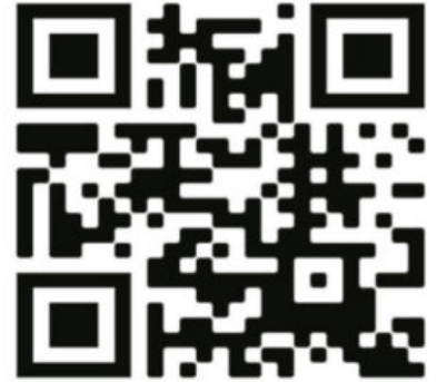
QR Code for the Parish Website

Don't forget to like our Facebook page at www.facebook.com/annunciationelma to be updated on all the latest news and events associated with our Parish.