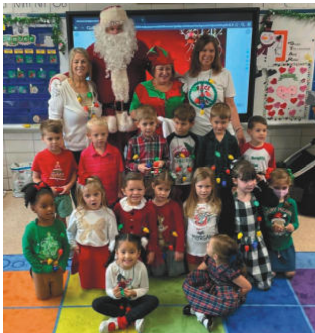
Santa made his annual trip to St. Matthew the Apostle School stopping by the PreK 3 and PreK 4 classes and visiting with all the good little boys and girls who were so excited to see him before Christmas break.

The cost is $25.00 to attend. For more information, call 504-861-6243.