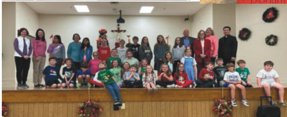
The students and teachers in the St. Matthew Elementary CCD Program had a great time at their Christmas party.

The CYO thanks all the parishioners who donated gifts to the Angel Tree this year. Your generosity is deeply appreciated.