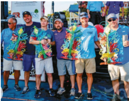
1st Place, 4 Guys & A Pot