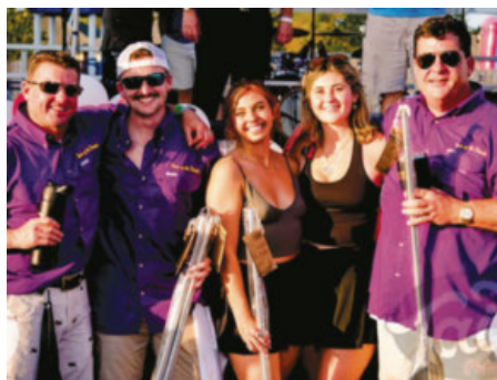
2nd Place, Tiger Tales