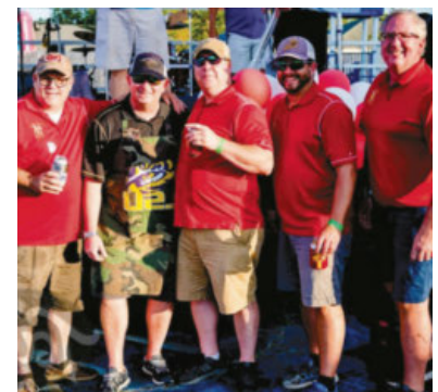
3rd Place, St. Clement of Rome