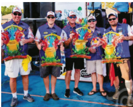
1st Place, Shake N Bake & People's Choice Winner