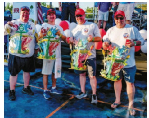
3rd Place, Rhumb Line