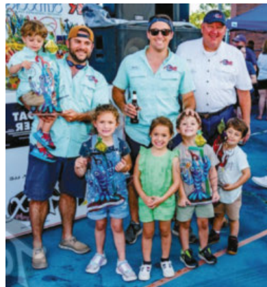
2nd Place, Men with Crawfish Sacks