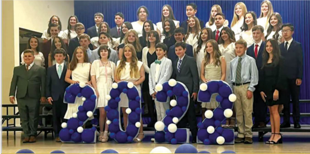
Congratulations 7th Grade graduates