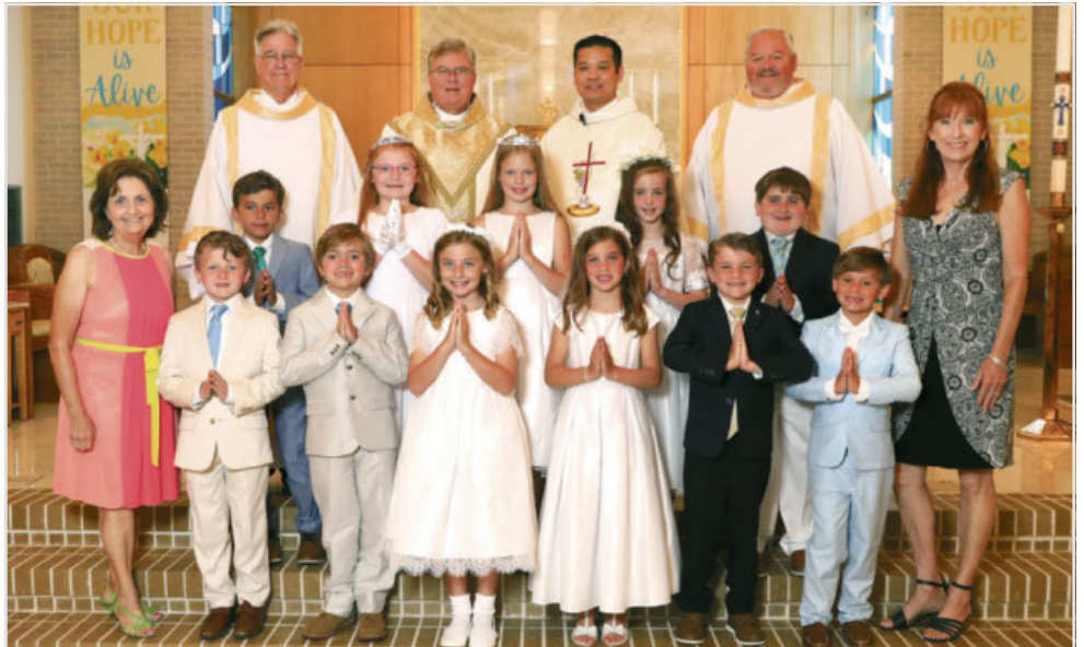
May 14, 2022 • First Communion

WE WELCOME INTO THE CHURCH OUR NEWLY CONFIRMED AND CONGRATULATE THOSE WHO PARTICIPATED IN THEIR VERY FIRST COMMUNION!