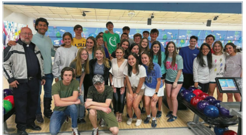
CYO enjoyed fellowship bowling with St. Rita