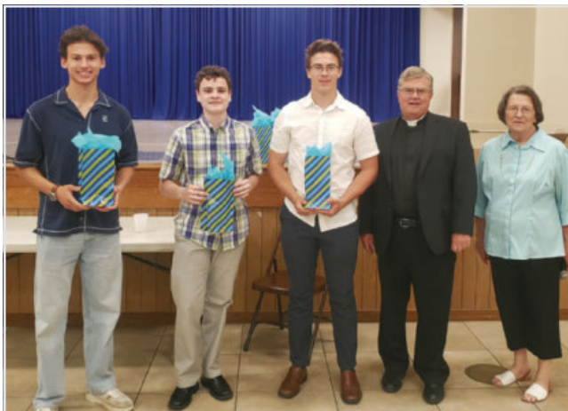
Senior Altar Servers were recognized for their service