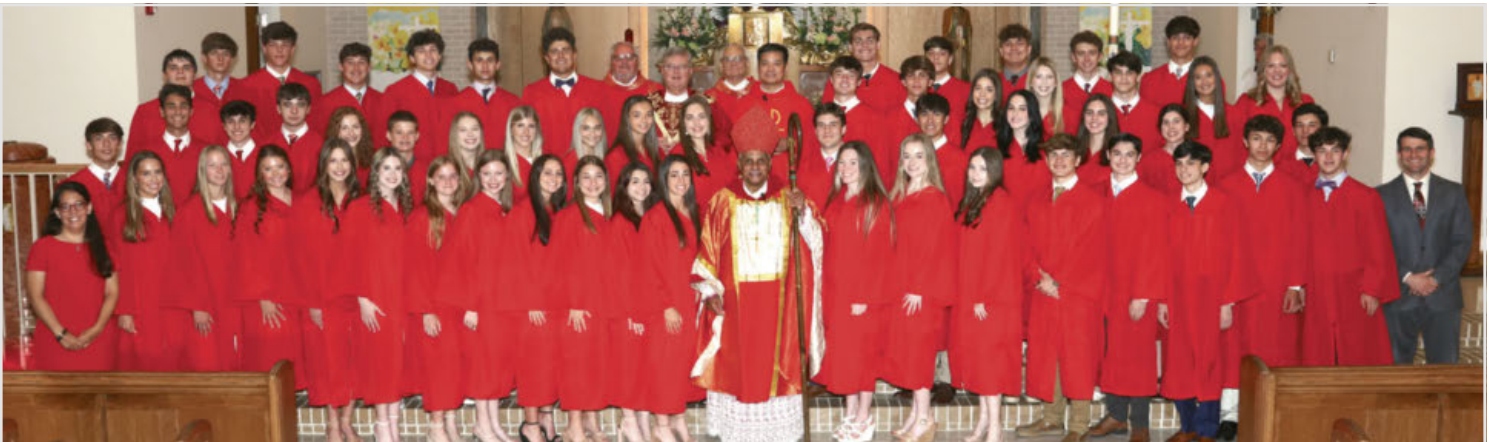
2022 • Confirmation