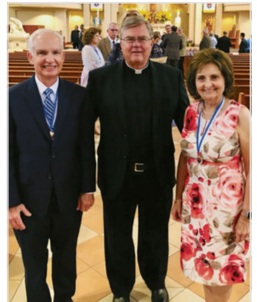
The St. Matthew St. Louis Medal winners