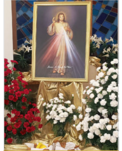
Church decorated for Divine Mercy