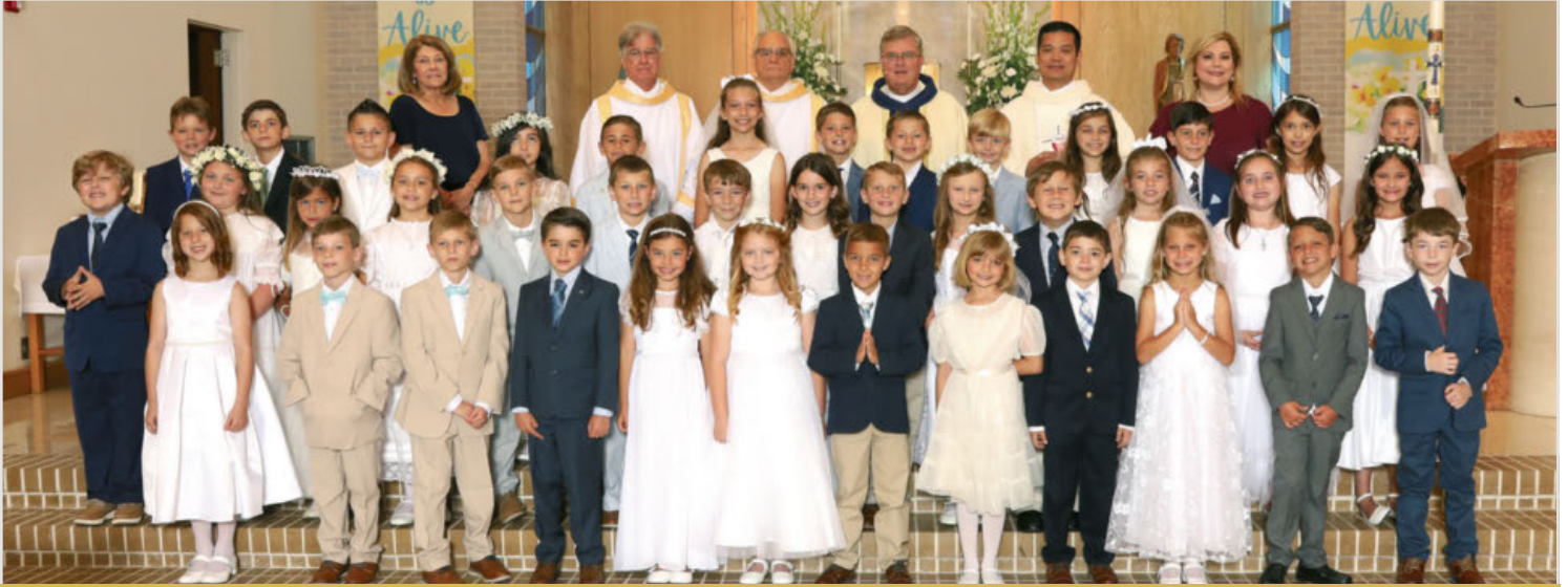
May 7, 2022 • First Communion