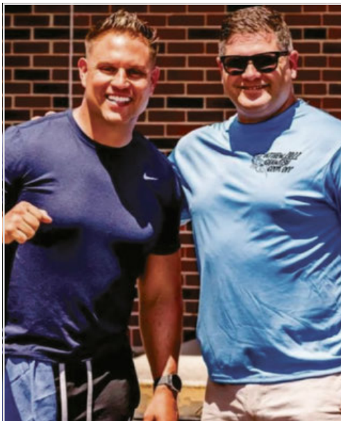
The Crawfish Cook-off was a huge success