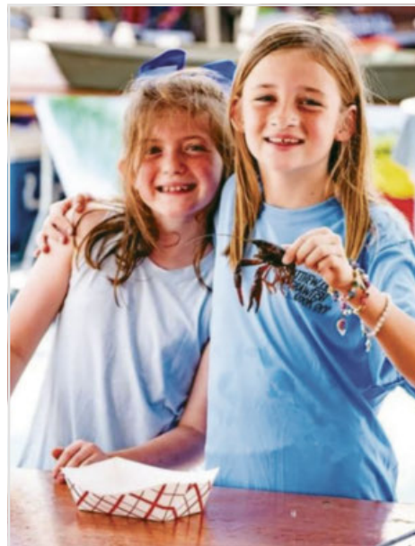
Everyone enjoyed the Crawfish Cook-off