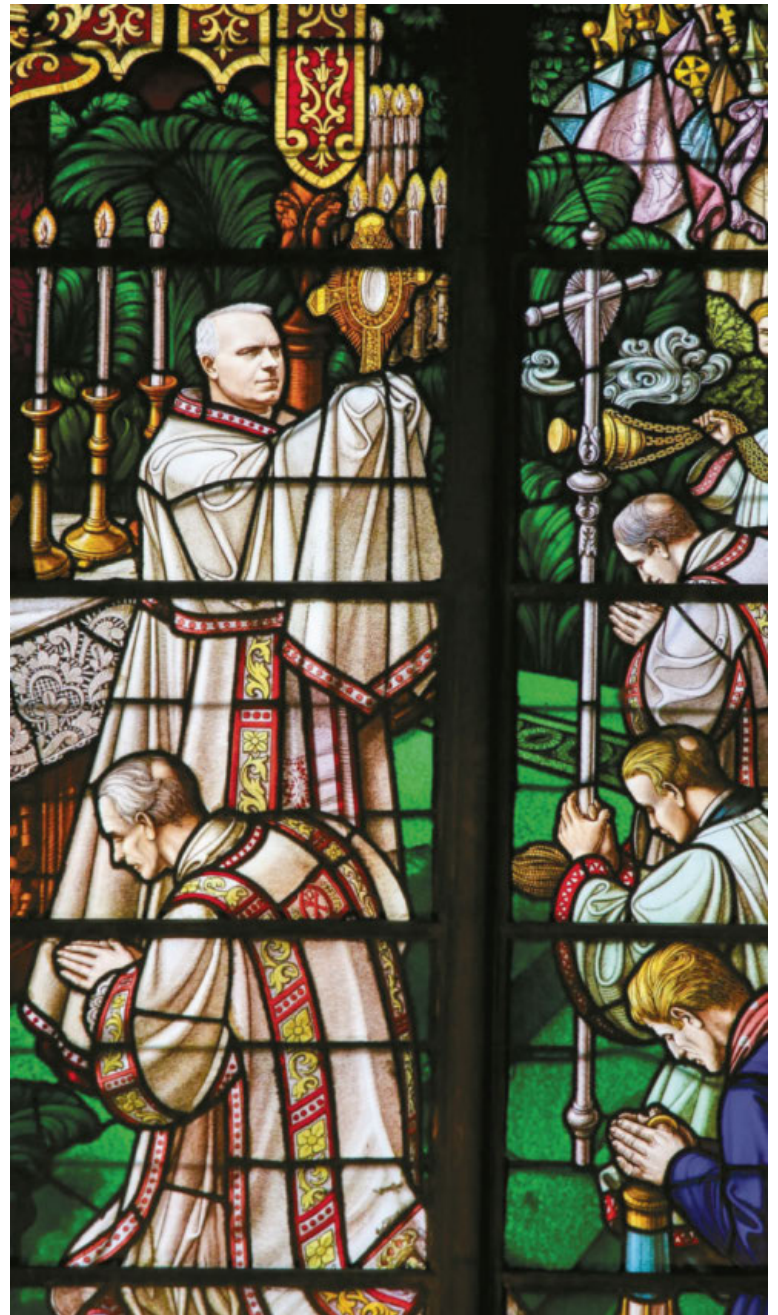
Cathedral of Saint Rumbold in Mechelen, Belgium

The Jews quarreled among themselves, saying, "How can this man give us his flesh to eat?" Jesus said to them, "Amen, amen, I say to you, unless you eat the flesh of the Son of Man and drink his blood, you do not have life within you. Whoever eats my flesh and drinks my blood has eternal life, and I will raise him on the last day. For my flesh is true food, and my blood is true drink. Whoever eats my flesh and drinks my blood remains in me and I in him. Just as the living Father sent me and I have life because of the Father, so also the one who feeds on me will have life because of me. This is the bread that came down from heaven. Unlike your ancestors who ate and still died, whoever eats this bread will live forever."