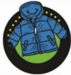
VETERAN COAT COLLECTION

The Fourth Degree of the Knights of Columbus is known as the Patriotic Degree in order to support our troops and veterans in a variety of ways. With that in mind, our Knights of Columbus will be collecting gently used winter coats for our veterans. All coats or jackets must be clean and can be brought to the West Gathering space on the weekends of January 8/9 and January 15/16. All coats will be given directly to the veterans to use during our coldest months in Michigan.