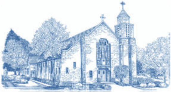
Sts. Cyril & Methodius Church Site 185 Laird Ave. NE Warren, Ohio 44483