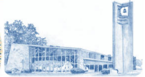
St. James Church Site 2532 Burton St SE Warren, Ohio 44484

February 14, 2021 Sixth Sunday in Ordinary Time