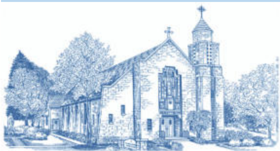
Sts. Cyril & Methodius Church Site 185 Laird Ave. NE Warren, Ohio 44483