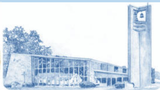
St. James Church Site 2532 Burton St SE Warren, Ohio 44484