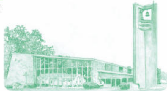
St. James Church Site 2532 Burton St SE Warren, Ohio 44484