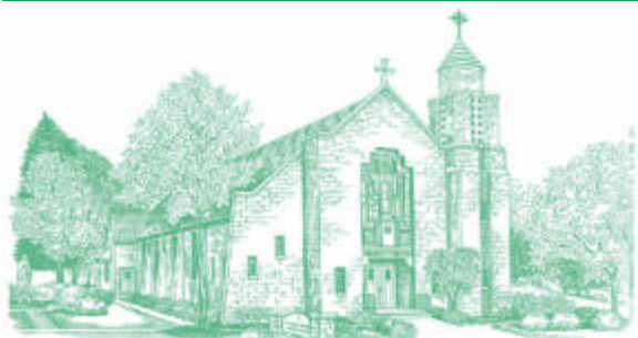
Sts. Cyril & Methodius Church Site 185 Laird Ave. NE Warren, Ohio 44483