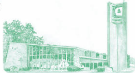
St. James Church Site 2532 Burton St SE Warren, Ohio 44484