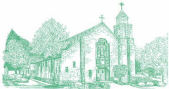
Sts. Cyril & Methodius Church Site 185 Laird Ave. NE Warren, Ohio 44483