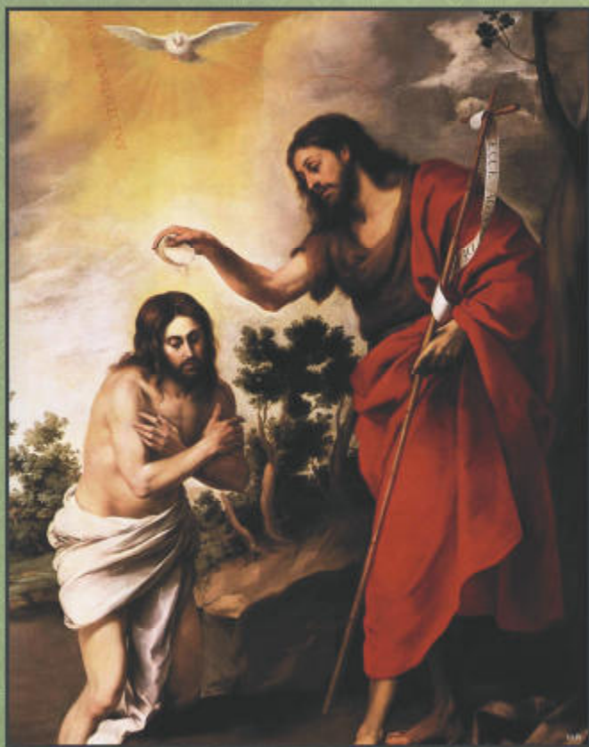
THE BAPTISM of the Lord

LETTERS OF RECOMMENDATION: Practicing faith and supporting church for at least 3 months.