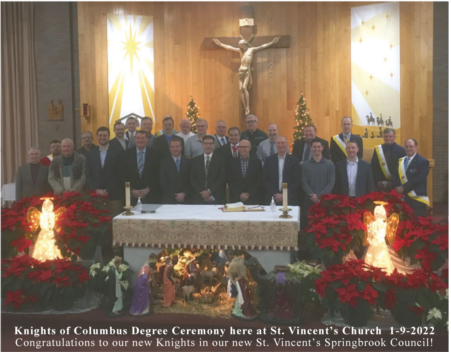
Knights of Columbus Degree Ceremony here at St. Vincent's Church 1-9-2022 Congratulations to our new Knights in our new St. Vincent's Springbrook Council!