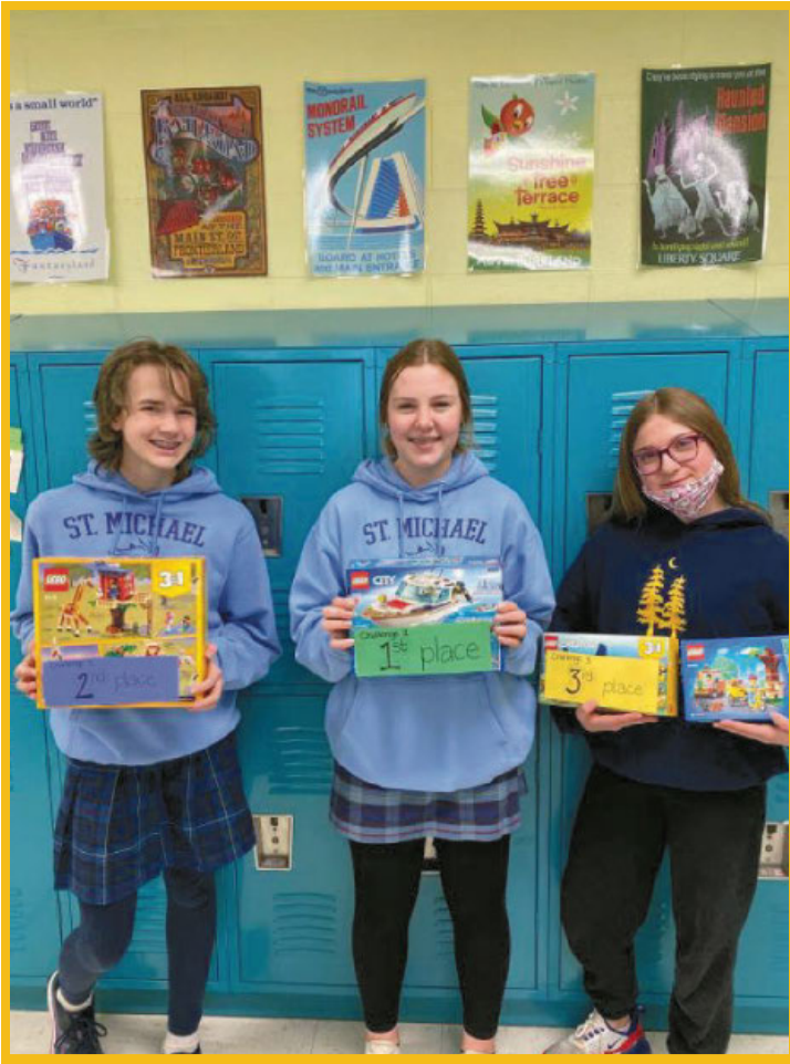
Pictured above: Winners of the St Michael PTO sponsored Student Council Lego Challenge. Thank you to all participating families!