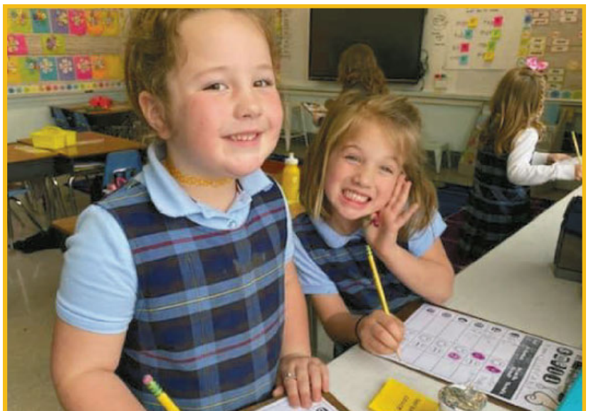
Pictured above: Kindergarten students learn all about their five senses; touch, taste, smell, sight, and sound.

CALL 513-554-3555 OR VISIT WWW.STMICHAELSHARONVILLE.ORG FOR MORE INFORMATION.