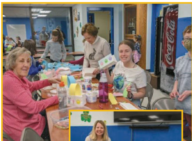
Pictured: Community gathers in service to others for Saint Michael Serves Day

Thanks to all for a great St. Michael Serves event on Saturday, March 19. It was amazing to be able to gather again in service to others and fellowship with our St. Michael family. We were blessed with an overabundance of donations for the Fernside blankets, SNdDN baked goods, and St. Vincent de Paul personal care items. The extra personal care items and baked goods went to the food pantry at Operation Give Back. The Easter baskets for Mercy Neighborhood Ministries turned out really cute and we ended up with about 20 pillowcases and a bunch of nice cards for Hospice veterans. We had some great helpers making dog/cat toys and made two huge bags of donations. Thank you to all who donated both goods and time to make this possible.