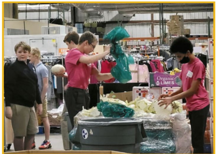
Above: Saint Michael School 7th and 8th graders got hands on at The Healing Center Cincinnati by helping sort food and clothing donations.