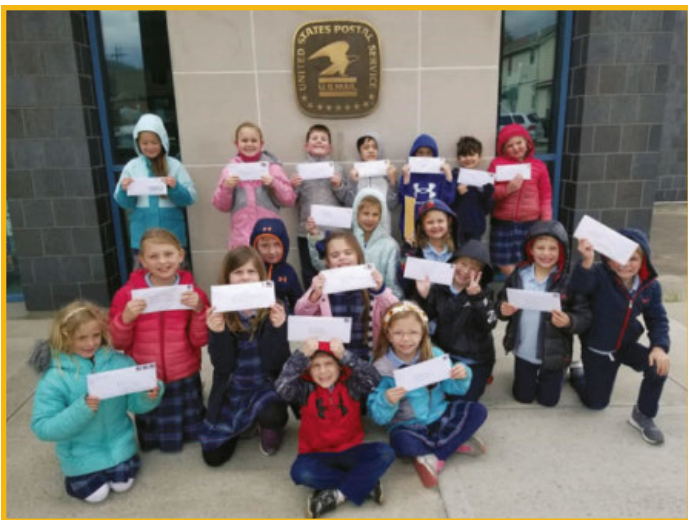
Above: Saint Michael School first graders visit the Sharonville Post Office for a behind the scenes tour and to mail Flat Stanley projects.