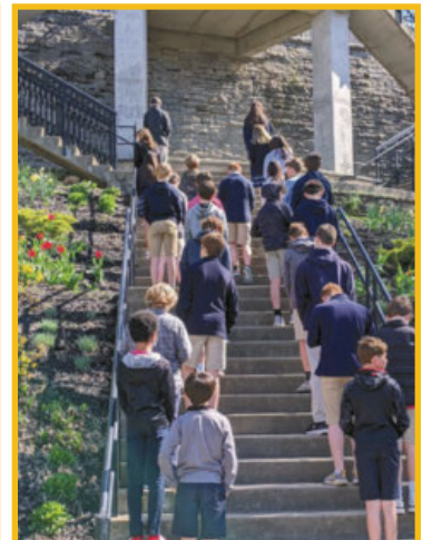
Pictured: Saint Michael School students visited the Holy Cross-Immaculata Church in Mount Adams to pray the steps.