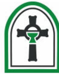
St. Malachi Parish

Welcome! New members are asked to register as soon as possible online, at the parish office or the sacristy, before or after Mass. Parishioners who are moving are asked to contact the office to update their information.