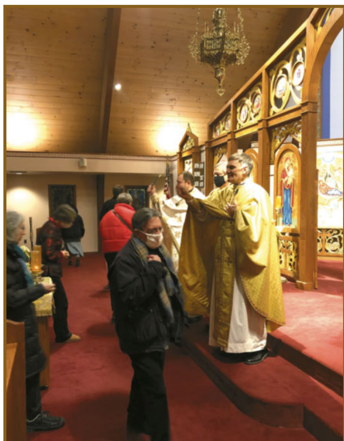
Both priests sprinkling members of the congregation with the newly blessed water