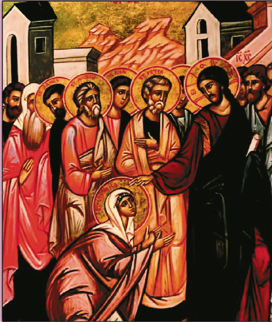
Icon of the Canaanite Woman (Matthew 15:21-29)