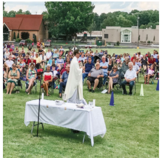
Included in Sunday’s schedule is outdoor Mass at 5:30 p.m. with a Eucharistic procession, followed by dinner sponsored by the Knights of Columbus.