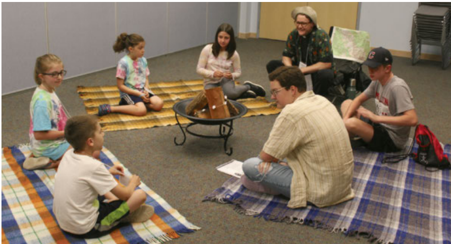
Each day campers will rotate between different areas including bible time, craft, music and games, all focused on this year’s theme “The Mass Comes Alive.”