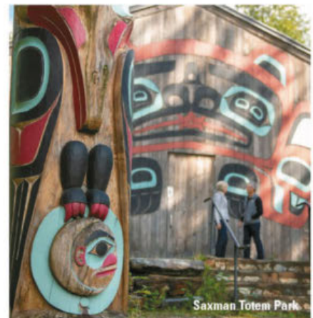
Saxman Totem Park