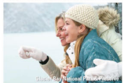
Glacier Bay National Park & Preserve