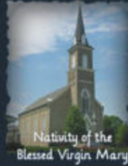
Nativity of the Blessed Virgin Mary